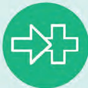
Minor Ailments Advice